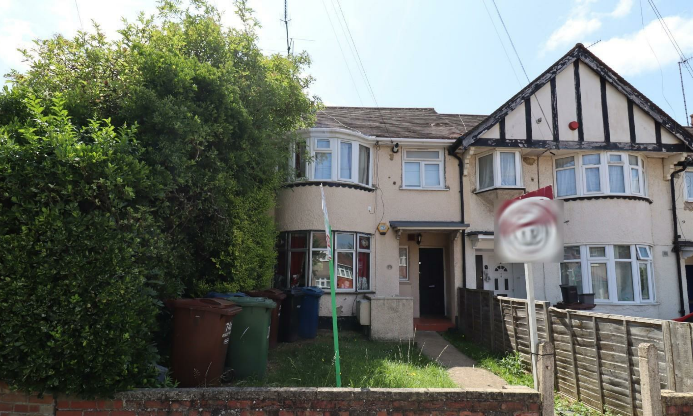
Dudley Road, Harrow, HA2 0PR Asking Price £220,000 1 1 1 C